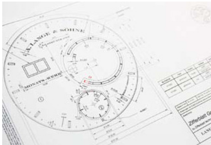
The approved dial of the LANGE 31 with all its dimensions

One of the factors that Lange designers appreciate most is intensive collaboration with calibre engineers. This is possible only in a true manufactory. Clearing technical hurdles and the odyssey to the perfect form are two processes that take place concurrently. Unlike brands that outsource raw movements and rely on designers to fashion the dials according to the specifications of their