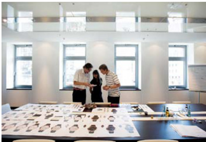
Countless dial versions are discussed by the design team

From the initial sketch to final acceptance, the design of the dial alone absorbed two years. That sounds like a long time, but it is part of Lange's heritage to repeatedly scrutinise in-house design iterations. After all, timelessness is one of the requirements imposed on Lange watches. Even after 30 or 50 years, they should not reveal their true age. But how can form be liberated from the influence of zeitgeist? Schetter's answer is surprisingly simply: "We can give things time. Because it is time alone that judges whether something is timeless."