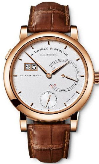
The new LANGE 31 in a pink-gold case

The eminent Saxon manufactory can take credit for a veritable stroke of genius: Not only is the LANGE 31 the first mechanical wristwatch with a tremendous power reserve of an entire month, it also preserves a stable rate for the full 31-day period. Two stacked mainspring barrels, each with a 185-centimetre long spring, store the necessary energy. A constant-force escapement between the twin mainspring barrel and the going train assures that the balance receives an identical amount of energy every ten seconds, regardless of the state of wind of the springs.